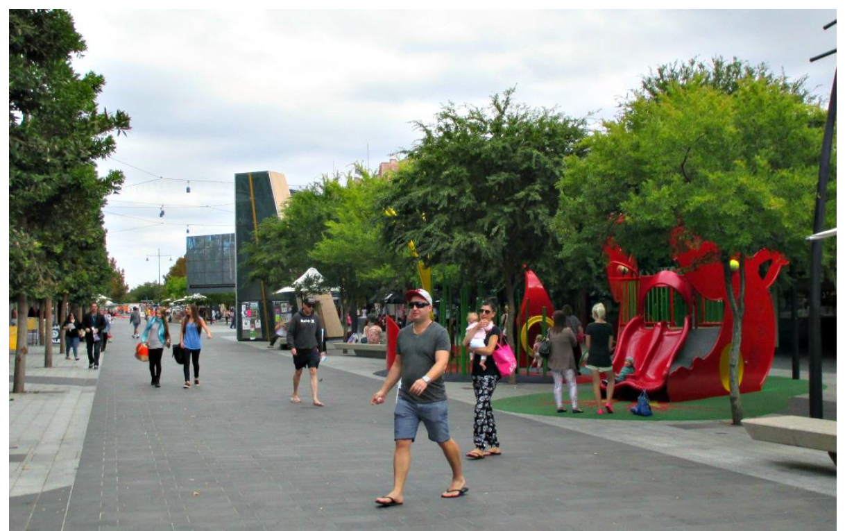
Figure 1 – Playground and pedestrian space in Hargreaves Mall, Bendigo. Why is there no similar space in central Melbourne?