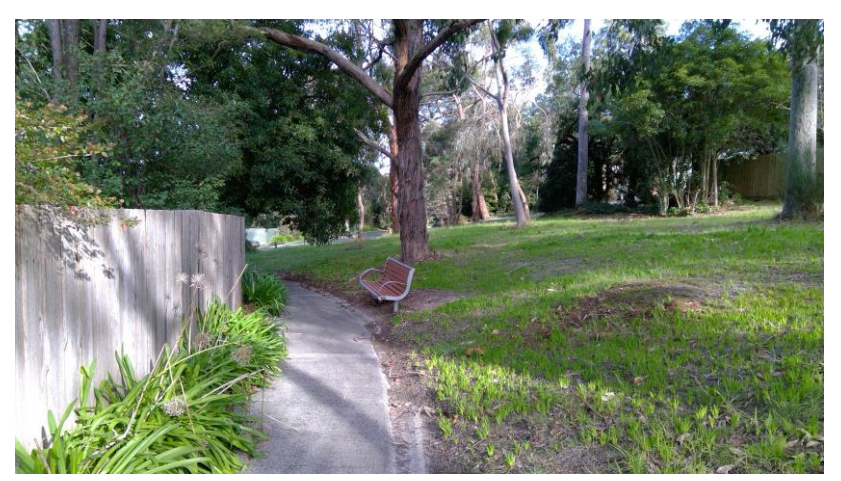
Figure 15 - The connection between Eastfield Rd and Orchard Drive. There are a number of excellent pedestrian connections through open space that could be promoted

Residents living within easy walking distance of the centre may not necessarily be conscious of that fact. This may be particularly true of people for whom the shortest route is via shortcuts through open space rather than the street network alone. Examples would be residents around Lusher Rd, Jesmond Rd, Shane Cres and Orchard Drive.