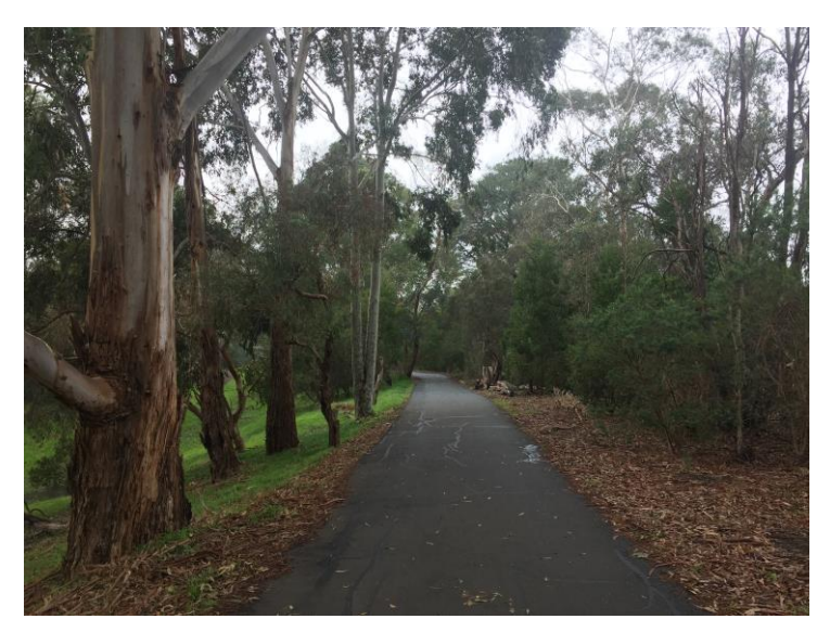
Figure 13 – Tarralla Creek Trail between Eastfield and Lusher Roads

There is no pedestrian crossing of Eastfield Rd in the area, apart from the intersection of Bayswater Rd. We have recommended that a crossing be provided to connect directly into the footpath along The Mall at the centre. This is a critical need, because it would serve anyone wanting to walk to the centre from the north-east of the catchment, including the north side of Eastfield Rd and the Tarralla Creek Trail. People coming from the north along Bayswater Rd might also chose to use this crossing rather than the signalised intersection.