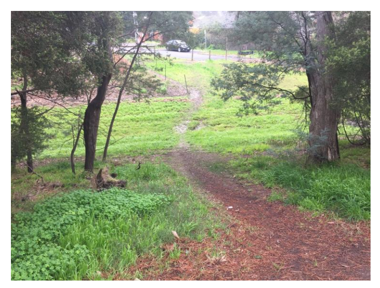
Figure 14 – informal connection only between Morris Rd and Tarralla Creek Trail