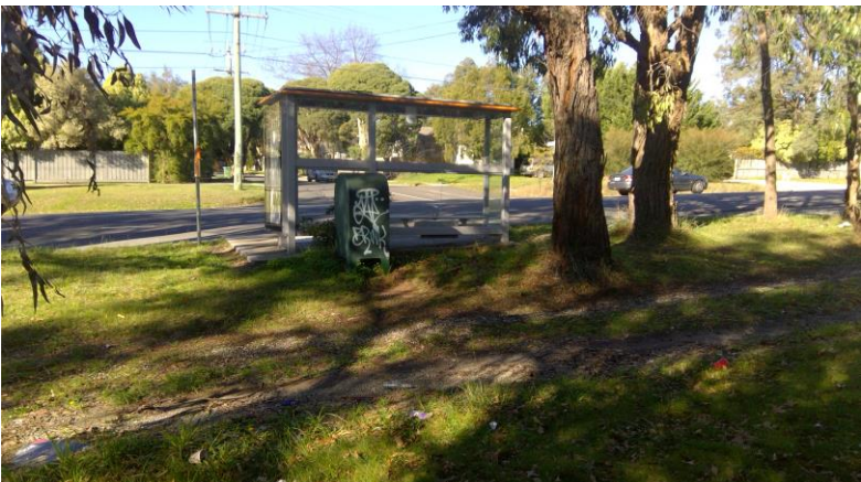
Figure 11 – common examples of lack of footpath connection to bus stops on Bayswater Rd

Bayswater Rd is a bus route, but pedestrian connections to the bus stops and capacity to cross this busy road to access the stops or other destinations is often limited. Many of our recommendations seek to address this.