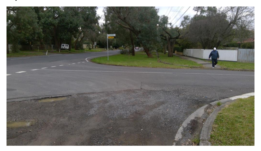
Figure 4 – common intersection configuration on Bayswater Rd

One of the most common issues identified in the assessment is the potential for high speed turning from main roads. Victoria Walks research <u>Safer Road Design for Older Pedestrians</u> identified right-turning and to a lesser extent left-turning vehicles (usually failing to give way) as the most common crash scenarios. This is a particular concern on Bayswater Rd, where many of the intersections have a splayed configuration that would allow fast turning. The footpath also tends to be some distance from the roadway. While theoretically this allows drivers to move off the main road before giving way, this may not be realistic, and also means pedestrians crossing side streets will be less conspicuous to vehicles on Bayswater Rd.