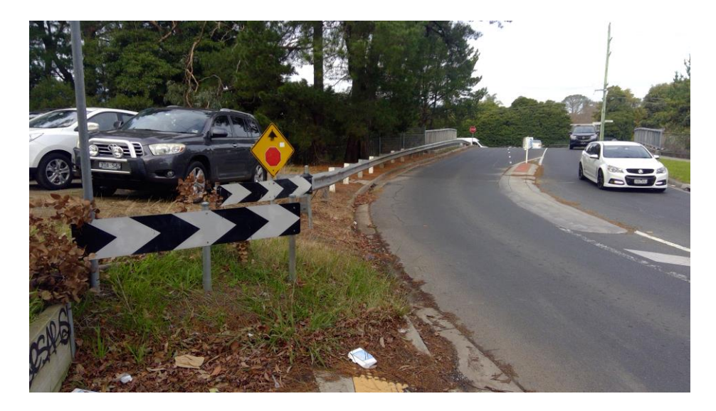
Figure 9 – on the return route from Maroondah Hospital, the footpath on the north side of Eastfield Rd ends at a critical point, the crossing of the railway line.

The steep hill up Eastfield Rd is the most noticeable feature of this corridor and will limit walking in the area.