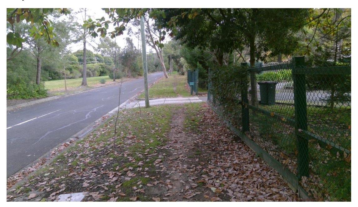
Figure 5 – a number of streets in Croydon South have no footpath, or only on one side

This conservative approach is also evident in the prioritisation of works. For example a number of streets were identified that did not have footpaths, or had a footpath on one side only. However we have not always recommended that a footpath be provided and, where we have, it is often identified as a lower priority for action. A lower priority recommendation should not be interpreted as unimportant, it simply reflects our relative consideration of the most important issues to address in order to improve pedestrian safety and amenity across the entire walking catchment. Works closer to the centre, where the highest number of people are likely to walk, have typically been given a higher priority than sites further away.