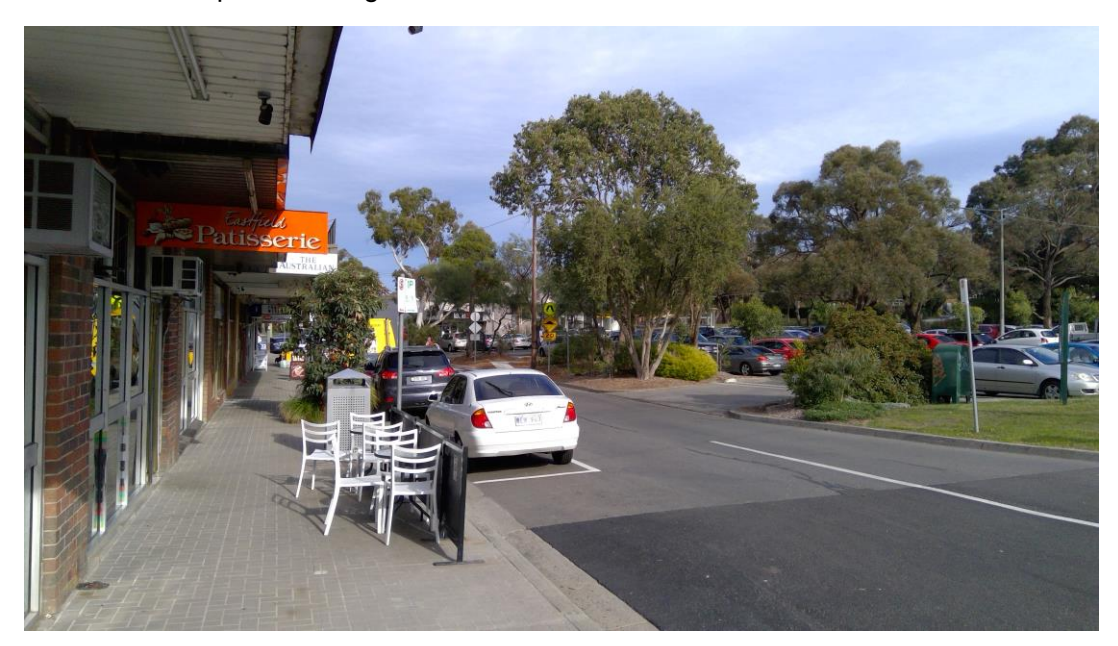
Figure 1 – The Mall

taken with free car parking that is not time restricted. While this makes it something of an autooriented centre, the car parking area is reasonably modest in size, well landscaped and due to the topography sits below the main roads, so does not overly dominate the centre. A service lane provides access to the rear of the main line of shops. Behind that runs Tarralla Creek, however this has been developed as a large stormwater drain.