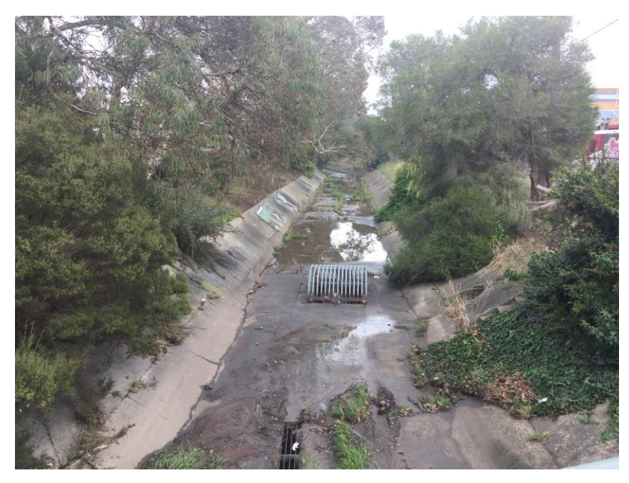
Figure 8 – Tarralla Creek next to the centre. Not the aesthetic asset that it could be

Tarralla Creek would seem to be a missed opportunity to provide a positive interface and approach to the centre. We have recommended that the council explore opportunities to naturalise the stream channel (point 3 in Section 5). This would be particularly important at the southern end of the centre, where the stream is a prominent feature of the approach but the concrete drainage channel and fencing does not present well. Subject to meeting drainage requirements, there may be an opportunity to turn a negative into a positive and make this an attractive landscape feature. It may also be possible to expand the centre somewhat and provide café's with outdoor dining overlooking this area.