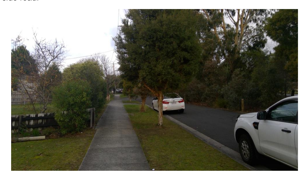
Figure 12 – typical north side of Eastfield Rd between Tarralla Creek Trail and park access at Blazey Rd

are generally configured with a standard design at a right-angle to Eastfield Rd, so the potential for fast turning into them is not unduly high. For that reason, we have identified desirable treatments without allocating them a high priority. Nonetheless, Eastfield Rd is fairly narrow for a major road, with no capacity for vehicles to wait to turn right without holding up the traffic behind. This may make drivers distracted and impatient to turn and therefore less likely to identify and give way to a pedestrian crossing a side road.