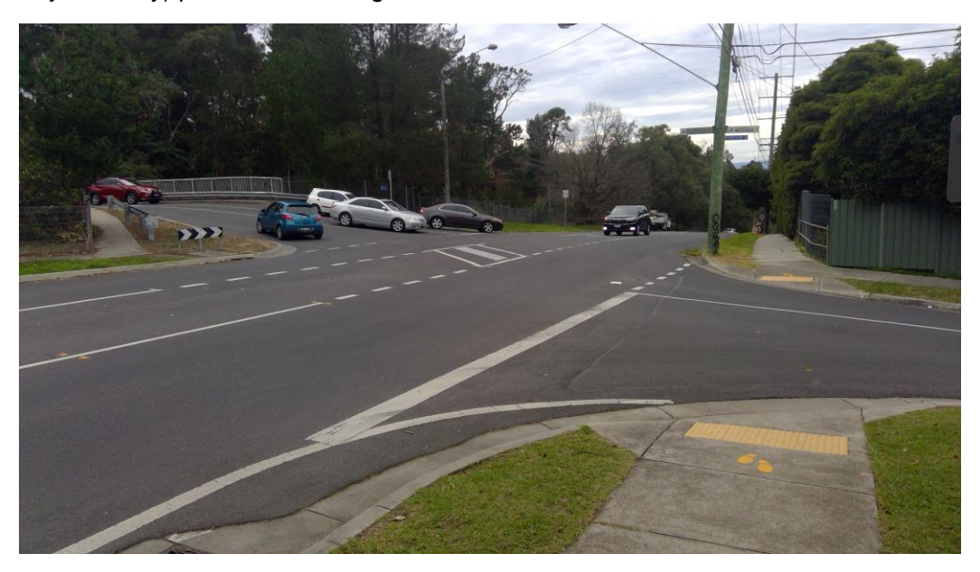
Figure 10 – the intersection of Eastfield Rd (top, all the cars in this photo are on Eastfield Rd), Morinda St (right) and Railway Ave (left).

There are no pedestrian crossings of Eastfield Rd, apart from the intersection of Bayswater Rd. The intersection with Railway Ave is a particular concern, with fast moving and turning traffic and no crossing facilities. Discussions with people in this area suggest they often avoid crossing here because it is (probably correctly) perceived as dangerous.