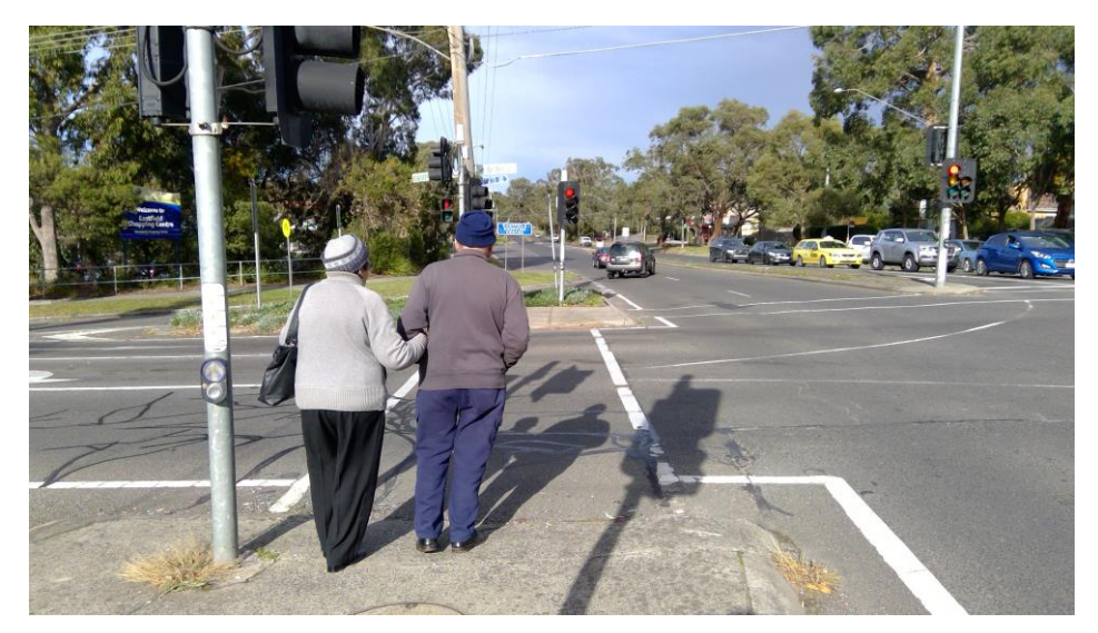
Figure 7 – crossing at the intersection of Eastfield and Bayswater Roads

Despite the presence of zebra crossings, the slip lanes at the intersection of Bayswater and Eastfield Roads are a concern. In our view, drivers tend to be focused on other traffic when approaching slip lanes. Victoria Walks is aware of pedestrians who have been killed on zebra crossings over slip lanes in Melbourne. We have recommended a number of changes at this intersection including construction of raised platforms for the zebra crossings to force drivers to slow and further highlight the need to give way.