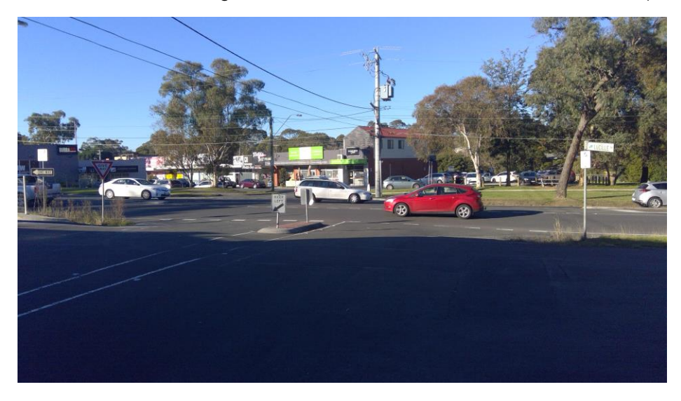
Figure 6 – the current situation facing people wanting to cross Bayswater Rd in the centre (Lucille Ave)

While there is provision to cross at the signalised intersection, it is not realistic to expect people to do that, given that it would involve walking a total additional distance of about 300 metres (there and back).