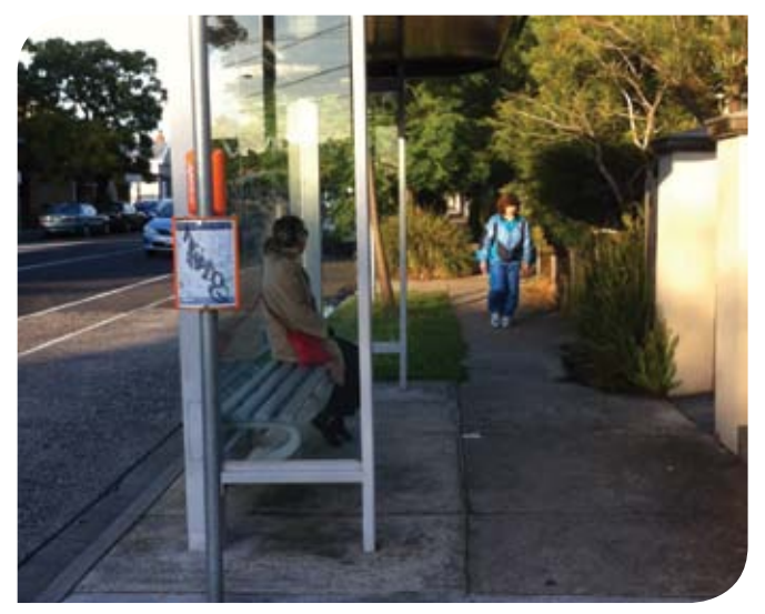
Good street furniture design – footpath remains clear and direct, views are unobstructed.

Poor street furniture design – structure blocks the footpath; creates a visual obstruction; and creates a potential point of pedestrian conflict that may lead people to walk into the roadway.